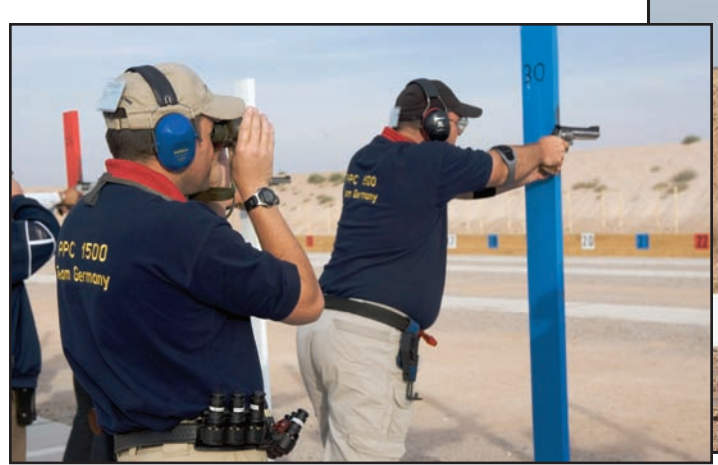
NPSC is truly an international competition. Competitors ventured to Albuquerque in 2006 from five foreign countries, including Canada, Venezuela, Russia, the Czech Republic, and Germany (pictured).