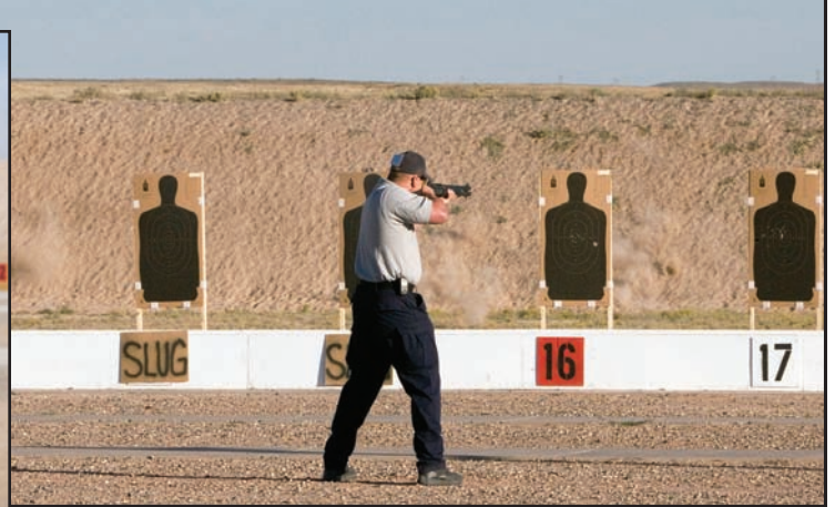
Revolvers and semi-automatic pistols aren't the only firearms used at NPSC. A shotgun event (pictured) is also held to measure long gun accuracy.