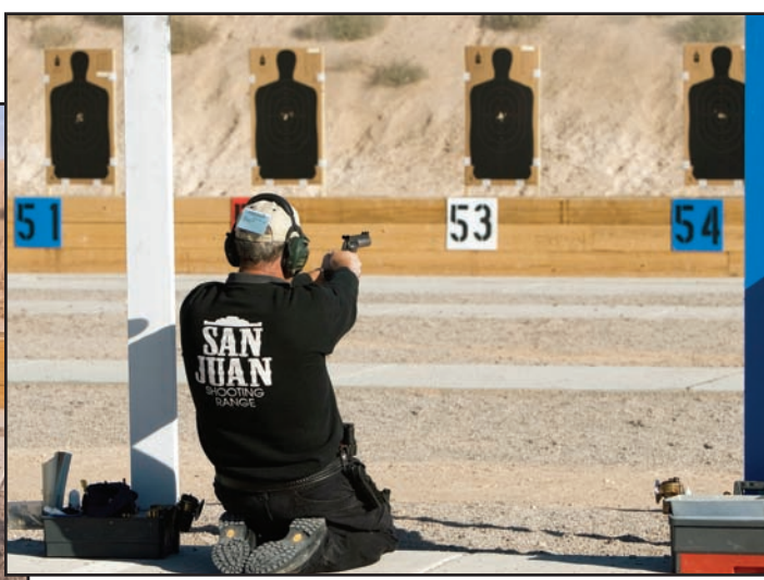
NPSC is the most comprehensive and prestigious police shooting competition in the world, testing officers' skills from a variety of distances and positions.