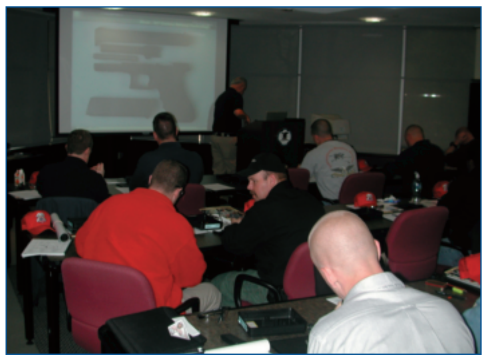
Seeing a need to expand armorer training and reduce costs for students, NRA hosts tuition-free armorer schools in cooperation with several manufactuers of law enforcement firearms.

While tuition is free, participants are responsible for all other expenses. Registration doesn't guarantee the selection to the class due to its overwhelming popularity. A random drawing chooses the seats. If selected a LEAD staff member will notify you by e-mail eight weeks prior to the school.