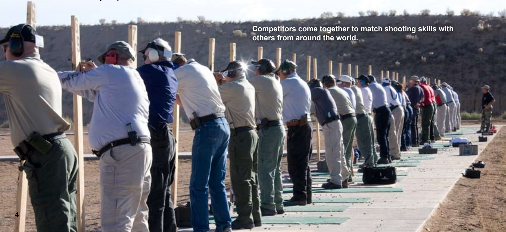
Competitors come together to match shooting skills with others from around the world.

Results, photos, and information from this year's championships are available at NRABlog.com .